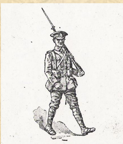
" England expects every man to do his duty."

The military information for those who died has been drawn from 'Soldiers Died in the Great War 1914 - 1919', a series of books published in the 1920s by the War Office listing over 600,000 casualties, now available on CD which can be viewed at several local libraries. The grave and memorial details are from the Commonwealth War Graves Commission web site (<u>www.cwgc.org</u>). The service details are taken from those held at the National Archive available online via ancestry.co.uk.