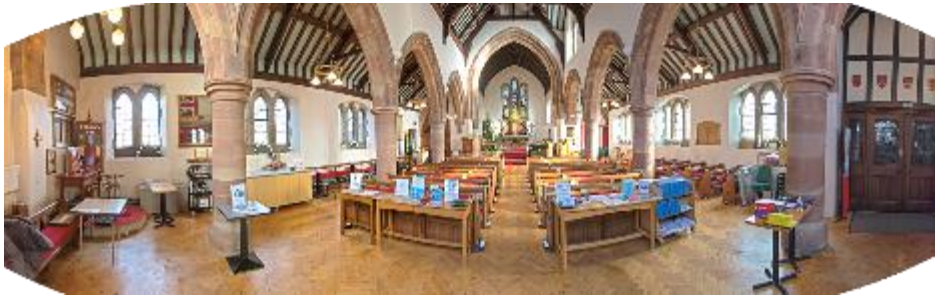
St Paul's, Warton

Europe has so many old churches that you'll never run out of subjects to photograph. In fact, you're spoiled for choice as there aren't enough years in a lifetime to visit (and to photograph) all of them, even in your own country, unless you're from a particularly small country such as Lichtenstein or Andorra. England has more than 16,000 parish churches and thousands more that belong to other denominations and religions. You may even find a few interesting modern churches, but they rarely have the same 'character' as old buildings.